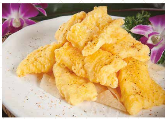
🌶️ 椒鹽鮮魚球 29. 98 Deep Fried Fish Fillet with Salt & Pepper