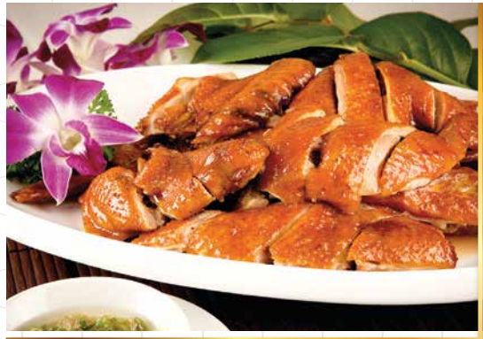
金牌豉油走地雞 (半隻) 28. 98 Soy Free Range Chicken Half (全隻) 53. 98 Whole