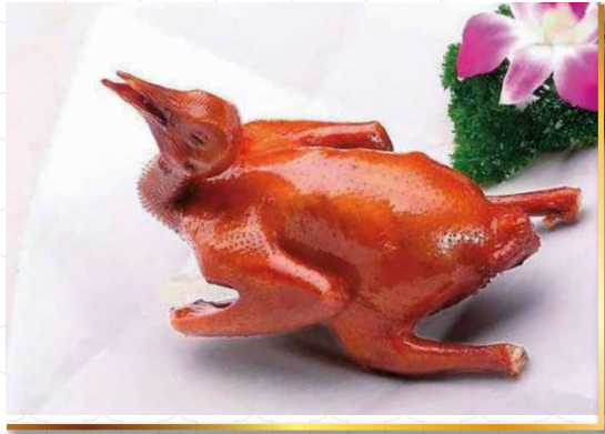
玻璃脆皮乳鴿皇 43. 98 /隻 Deep Fried Squab Each