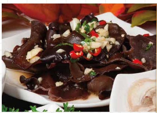
香醋涼拌雲耳 15. 98 Marinated Black Fungus