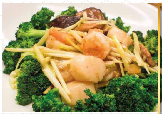
翡翠炒蝦球帶子 43. 98 Sautéed Prawn & Scallop w/ Seasonal Green