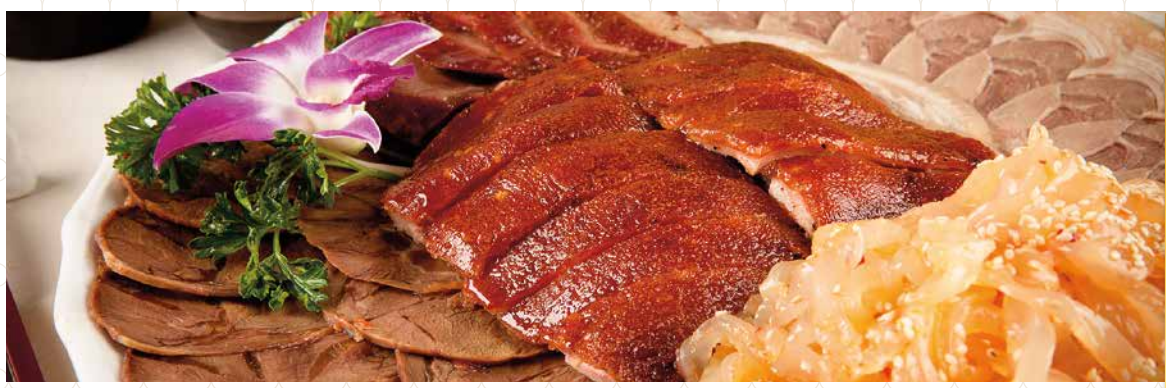
鴻星乳豬大拼盤 138. 98 Red Star Suckling Pig Platter