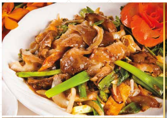
蔥爆海參桂花蚌 88. 98 Sautéed Sea Cucumber & Sea Cucumber Muscle w/ Scallion