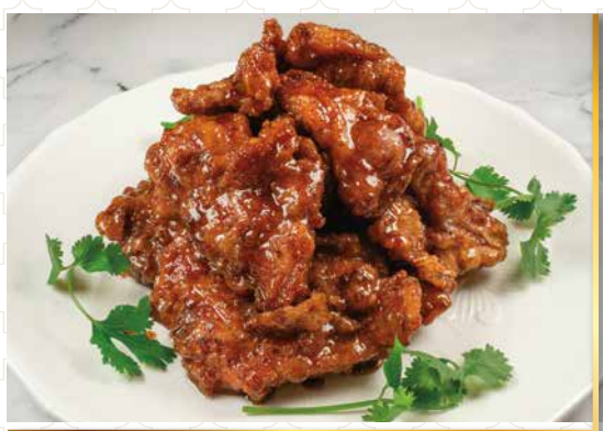
原隻菠蘿咕嚕肉 43. 98 Sweet & Sour Pork with Fresh Pineapple