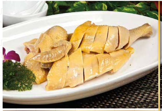
馳名貴妃走地雞 (半隻) 28. 98 Marinated Free Range Chicken Half (全隻) 53. 98 Whole