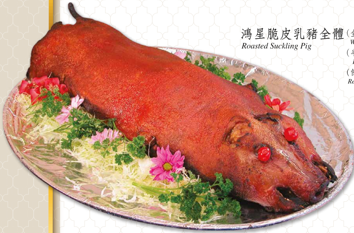
鴻星脆皮乳豬全體 (全體) 438. 00 Roasted Suckling Pig Whole (半隻) 238. 00 Half (例牌) 68. 98 Regular