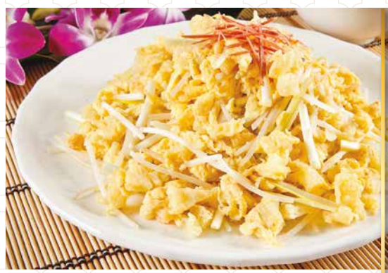
🌶️ 川椒龍鳳球 38. 98 Sautéed Prawns & Chicken in Sichuan Style