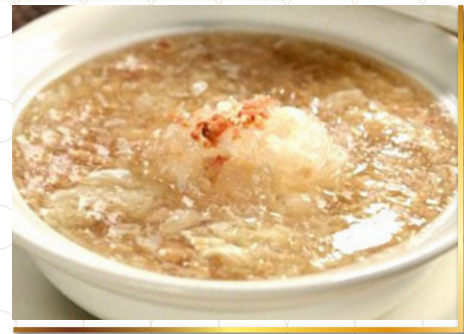
野生南非乾鮑 Braised Dried Whole South African Abalone