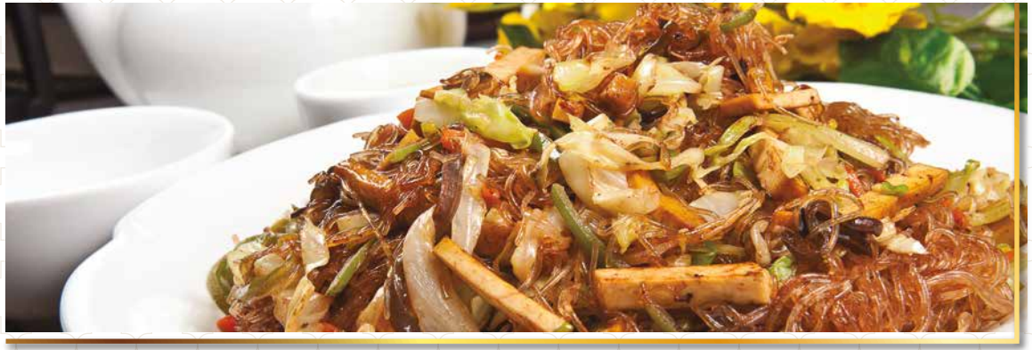
乾炒羅漢上素齋 29. 98 House Special Buddha's Feast