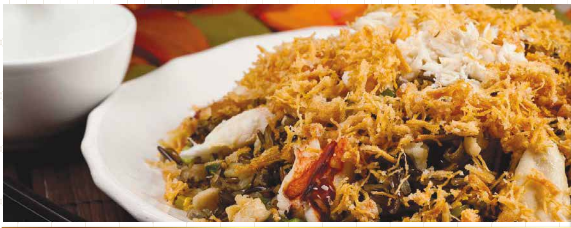
鴻星養生野米飯 48. 98 Red Star Special Fried Wild Rice