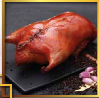
33.98 半隻 Half