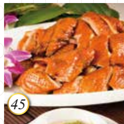
45 金牌豉油雞(半隻) Soy Free Range Chicken (Half) 25.98