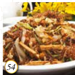
54 乾炒羅漢上素齋 House Special Buddha's Feast 15.98