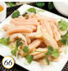
66 白灼金菇桂花蚌 Poached Sea Cucumber Muscles w/ Enoki Mushroom 29.98