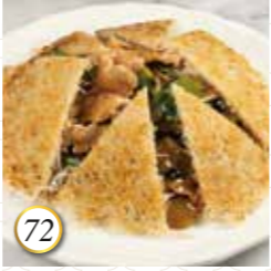
72 味菜涼瓜豬頸脊煎米粉 Pan Fried Vermicelli w/ Pork Jowl & Bitter Melon 35.98