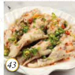
43 泰式鳳爪 Crystal Chicken Feet w/ Thai Sauce 18.98