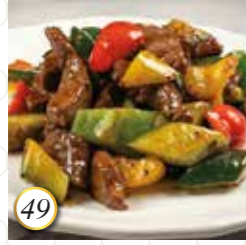
49 黑椒青瓜牛柳粒 Diced Beef & Cucumber with Black Pepper 20.98