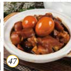
47 秘制豬腳薑醋 Pork Knuckles & Egg with Ginger Vinegar 29.98