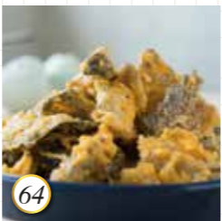
64 金沙脆魚皮 Fried Crispy Fish Skin w/ Salty Egg Yolk 15.98