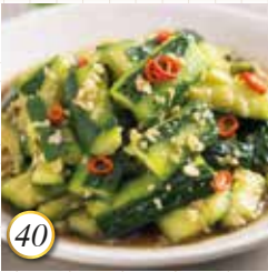
40 陳醋手拍青瓜 Marinated Cucumber with Garlic & Vinegar 13.98