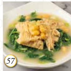
57 銀杏腐皮浸豆苗 Poached Pea Tips & Beancurd Sheet in Broth 18.98