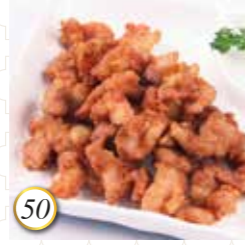
50 椒鹽雞膝 Deep Fried Chicken Joints w/ Spicy Salt 18.98