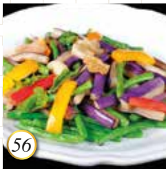
56 蒜香茄豆合炒 Stir Fried Eggplant & String Bean w/ Garlic 15.98