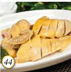
44 馳名貴妃走地雞(半隻) Marinated Free Range Chicken (Half) 25.98