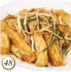
48 豉油皇煎腸粉 Pan Fried Rice Rolls w/ Supreme Soy Sauce 15.98