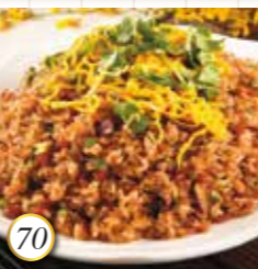
70 特色臘味糯米飯 Fried Sticky Rice with Preserved Meat & Sausage 29.98