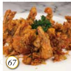
67 椒鹽老虎蝦 Pan Fried Prawn w/ Spicy Salt 18.98