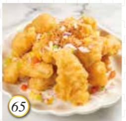
65 椒鹽炸鮮魷 Deep Fried Squid with Salt & Pepper 18.98