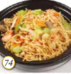
74 海鮮煲仔伊麵 Braised E-Fu Noodle w/ Assorted Seafood 32.98