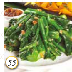
55 大地魚炒芥蘭片 Sautéed Chinese Broccoli w/ Dried Flatfish 18.98