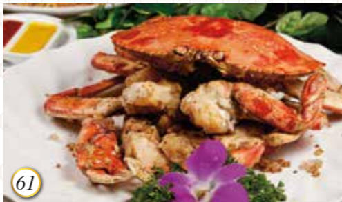
61 鴻星招牌胡椒蟹 Stir Fried BC Crab with Pepper 時價 Current Price