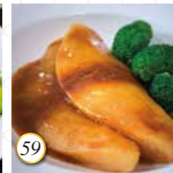
59 蝦子柚皮 Braised Pomelo Peel with Dried Shrimp Roe 18.98