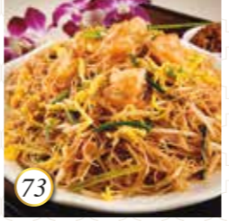
73 家鄉炒米粉 Stir Fried Vermicelli w/ Shrimp & Preserved Meat 31.98