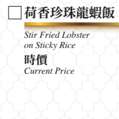
62 荷香珍珠龍蝦飯 Stir Fried Lobster on Sticky Rice 時價 Current Price