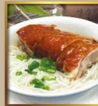
招牌燒鴨瀨粉 18.98 BBQ Duck with Rice Spaghetti in Soup