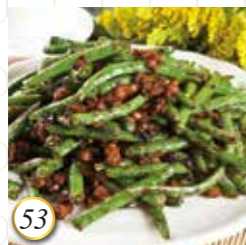
53 乾煸四季豆 Stir Fried String Bean w/ Minced Pork 16.98