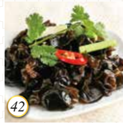
42 香醋涼拌雲耳 Marinated Black Fungus 13.98