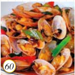
60 豉椒炒蜆 Stir Fried Clams w/ Pepper & Black Bean Sauce 19.98