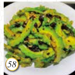
58 蒜頭豆豉炒涼瓜 Stir Fried Bitter Melon w/ Garlic & Black Bean Sauce 16.98