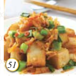
51 金網XO醬炒蘿蔔糕 Stir Fried Radish Cake with Spicy X.O. Sauce 17.98