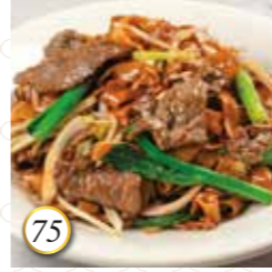
75 翡翠乾炒牛河 Pan Fried Rice Noodle w/ Beef & Veggie 29.98