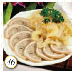
46 海蜇汾蹄 Marinated Jelly Fish & Pork Hock 16.98