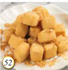
52 金沙滑豆腐 Deep Fried Golden Tofu with Garlic 15.98