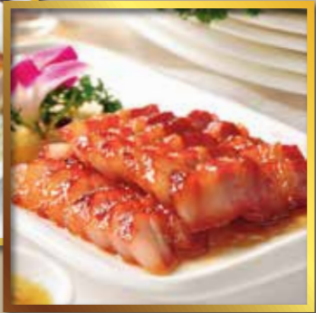
自製蜜汁叉燒 17.98 House Special BBQ Pork