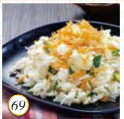
69 蛋白瑤柱原粒帶子炒飯 Scallop & Egg White Fried Rice 35.98