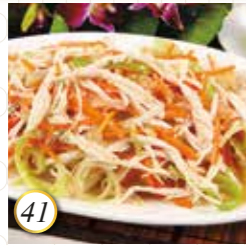
41 撈起手撕雞 Shredded Chicken & Jelly Fish Salad 15.98